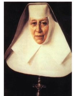
St. Katharine Mary Drexel

In sixty years of service, Katharine dispensed roughly $20 million toward the foundation of missions, schools and convents. The nuns in her order were persecuted for their work with "people of color", but they saw in all people "children of God". In this regard, they said beautifully, "How truly was the Cave of Bethlehem the great educator of the world!"